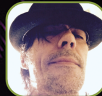
BOX & MANUAL LOBO