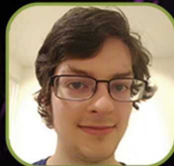
MUSIC & SFX PULSEBOT