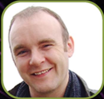
CODE & GRAPHICS JASON ALDRED