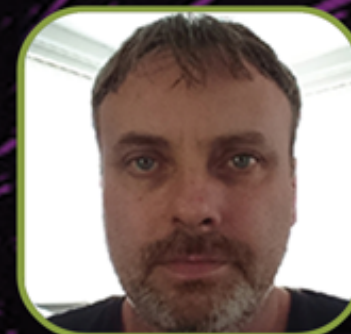
GRAPHICS & SFX SAUL CROSS