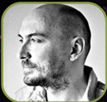
CONCEPT ART FLEMMING DUPONT